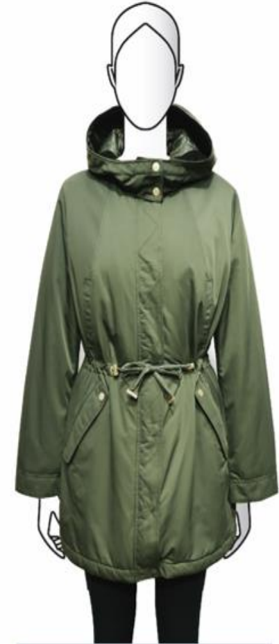
Funnel Neck Longline Parka. adjustable drawstring waist, cuffs and a funnel neck, internal quilting.