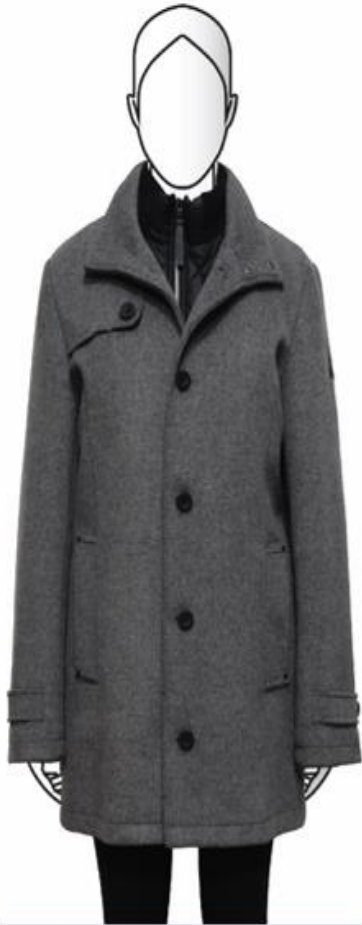
Wool Coat with internal quilted windbreaker.