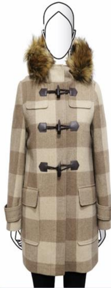
Duffle Coat with Wool, Detachable snug faux fur trim on hood, three faux leather toggles with contrast rope