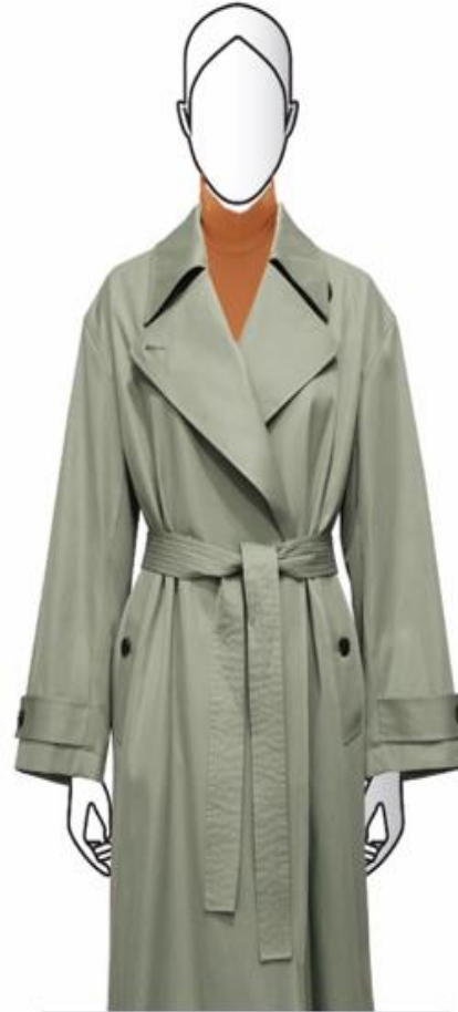
Trench Coat with oversized fit, minimalist design 80%POLYESTER, 20%COTTON