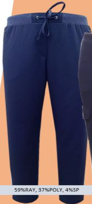
59%RAY, 37%POLY, 4%SP