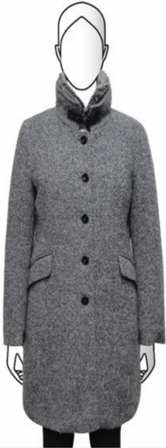
Wool Coat with internal quilted windbreaker. 55%POLYESTER, 30%WOOL, 15%PAN