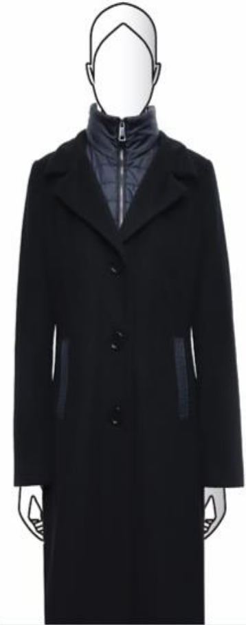
Wool Coat with internal quilted windbreaker. 50%WOOL, 50%POLYESTER