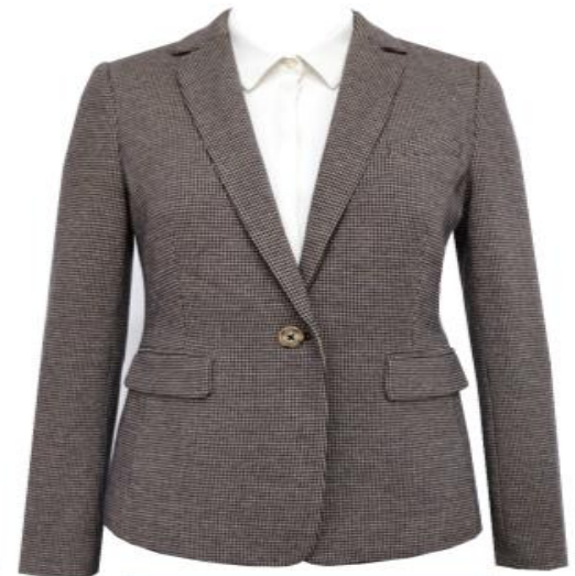
46%CTN, 38%POLY, 15%RAY, 1%EL