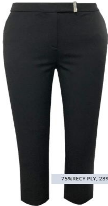
75%RECY PLY, 23%LENZ V, 2%SP