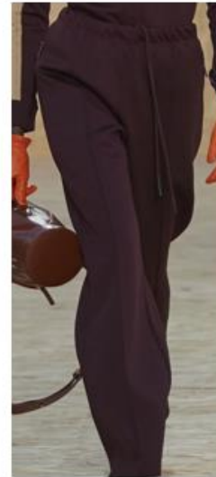
The Pull-On Trousers